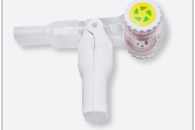
Rotate the mouthpiece cover to convert to convenient handle